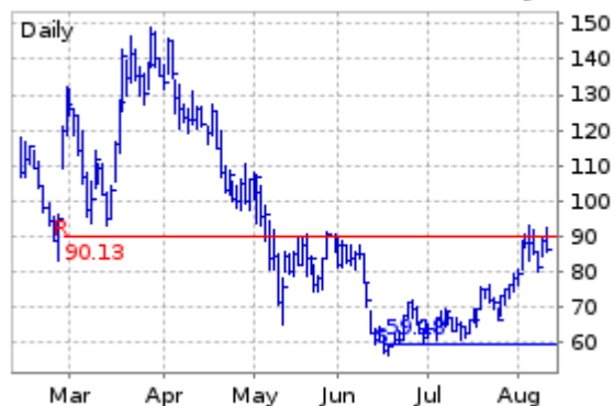
Block Inc (SQ US) 85.99 11 Aug 2022