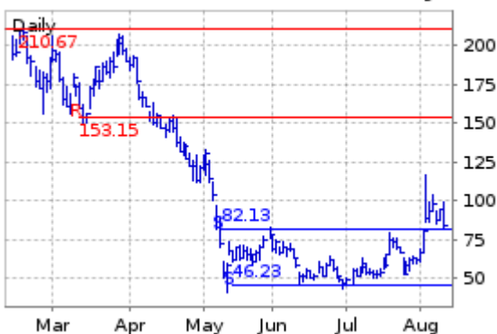
Coinbase Global Inc (COIN US) 84.0 11 Aug 2022