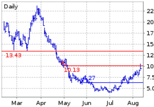
Riot Blockchain Inc (RIOT US) 9.52 11 Aug 2022