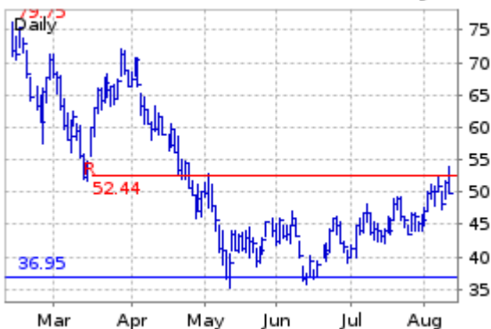
ARK Innovation ETF (ARKK US) 49.92 11 Aug 2022