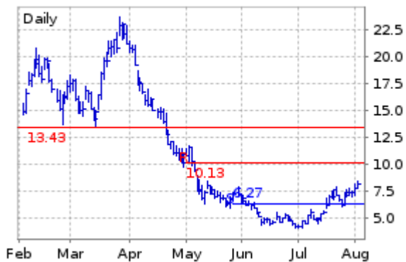
Riot Blockchain Inc (RIOT US) 8.12 03 Aug 2022