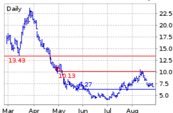
Riot Blockchain Inc (RIOT US) 6.79 26 Aug 2022