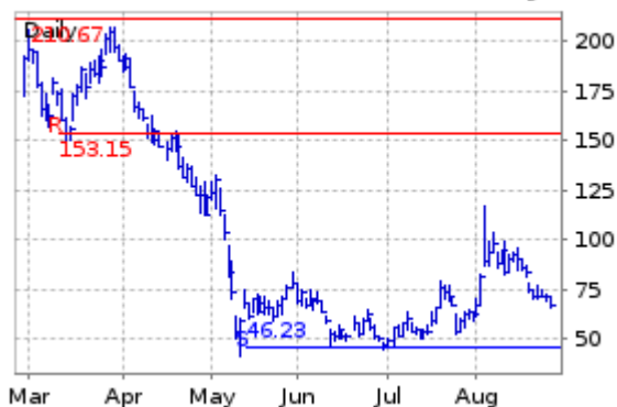
Coinbase Global Inc (COIN US) 66.74 26 Aug 2022