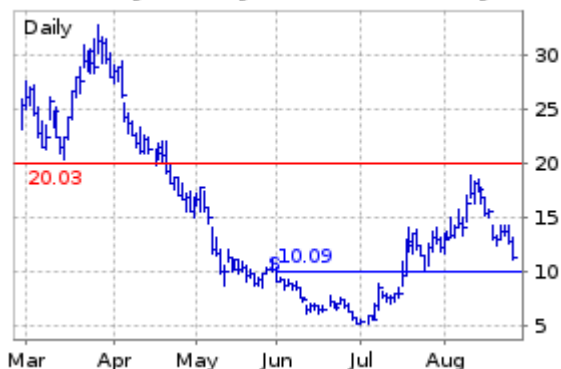
Marathon Digital Holdings Inc (MARA US) 15.35 26 Aug 2022