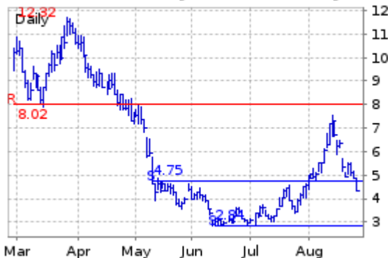
HIVE Blockchain Technologies Ltd (HIVE US) 4.48 26 Aug 2022