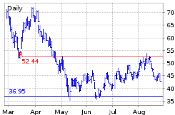
ARK Innovation ETF (ARKK US) 42.84 26 Aug 2022