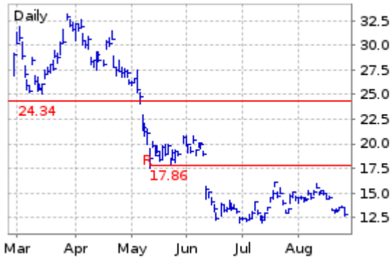
Bitcoin Investment Trust (GBTC US) 12.8126 Aug 2022