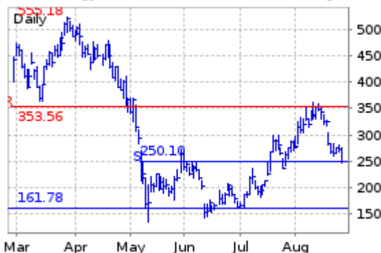
Microstrategy Inc-CIA (MSTR US) 249.2 26 Aug 2022