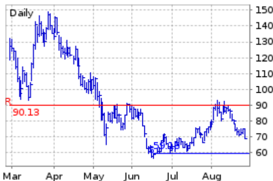
Block Inc (SQ US) 68.87 26 Aug 2022